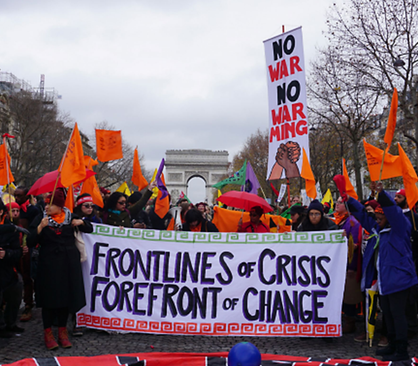
It Takes Roots, "Frontlines of Crisis, Forefron of Change." 2017. JPEG.

Copyright © 2017 Climate Justice Alliance and Indigenous Environmental Network. All rights reserved.