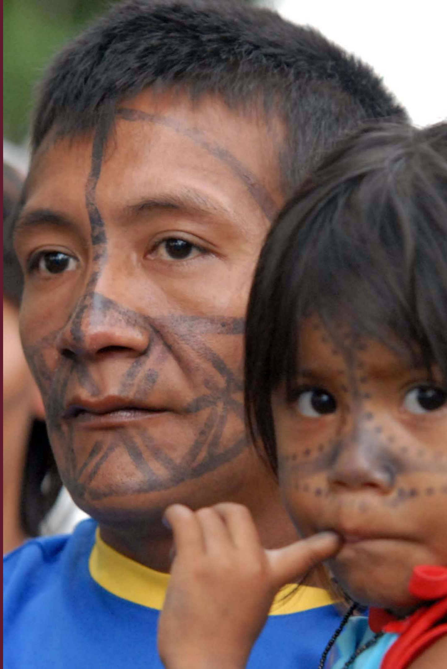
Indios da tribo Tucuxi participam do Fórum Social Mundial 1006 FP6469. 2009. https://commons.wikimedia.org/wiki/File:Indios_da_tribo_Tucuxi_participam_do_F%C3%B3rum_Social_Mundial_1006_FP6469.jpg. Digital Photography. 11/2/2017.