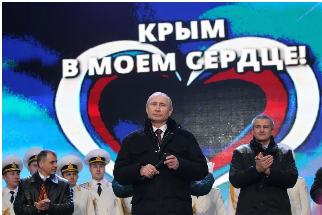
Russian President Vladimir Putin and the Russian-installed head of Crimea, Sergei Aksyonov, far right, attend a rally at Red Square in Moscow, Russia, on March 18, 2014, after Putin annexed Crimea from Ukraine.

Those assurances were put to the test in 2014, when Russia invaded Ukraine. Russia annexed the Crimean Peninsula and backed a rebellion led by pro-Russia separatists in the eastern Donbas region. ( The conflict in eastern Ukraine has killed more than 14,000 people to date. )