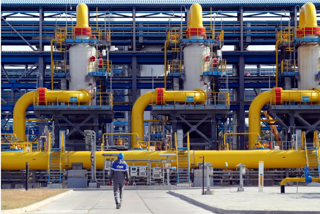
A worker at a compressor station for the Nord Stream 2 offshore natural gas pipeline, in Ust-Luga, Russia, in July 2021. Once operational, the Nord Stream 2 pipeline will supply gas from Russia to Germany.