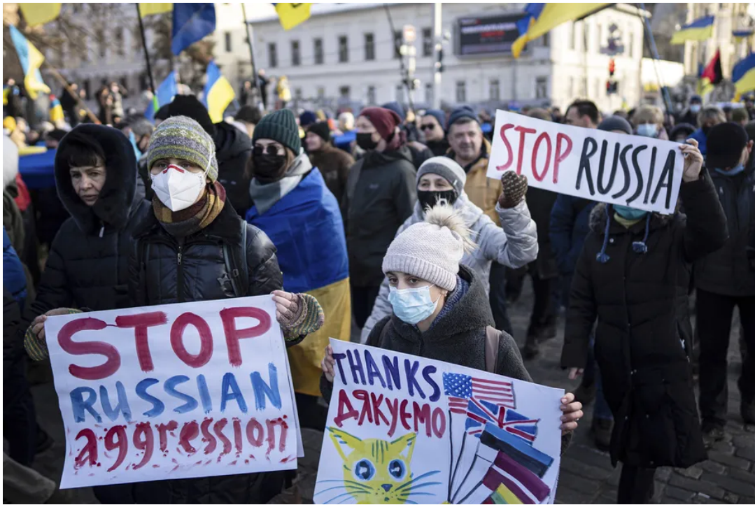
Demonstrators with Ukrainian national flags and posters march in the center of Kharkiv, Ukraine, on February 5. Kharkiv is Ukraine's second largest city, just 25 miles from some of the tens of thousands of Russian troops massed at the border.