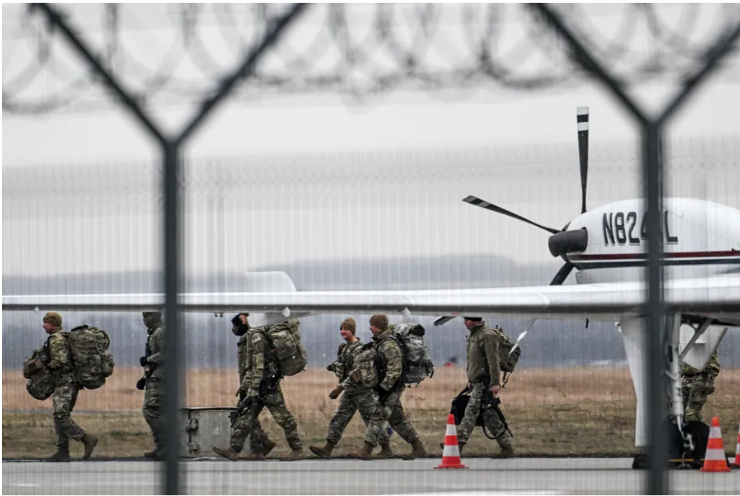
US troops exit a transport aircraft in Rzeszow, Poland, on February 6, as tensions between the NATO alliance and Russia continue to intensify.