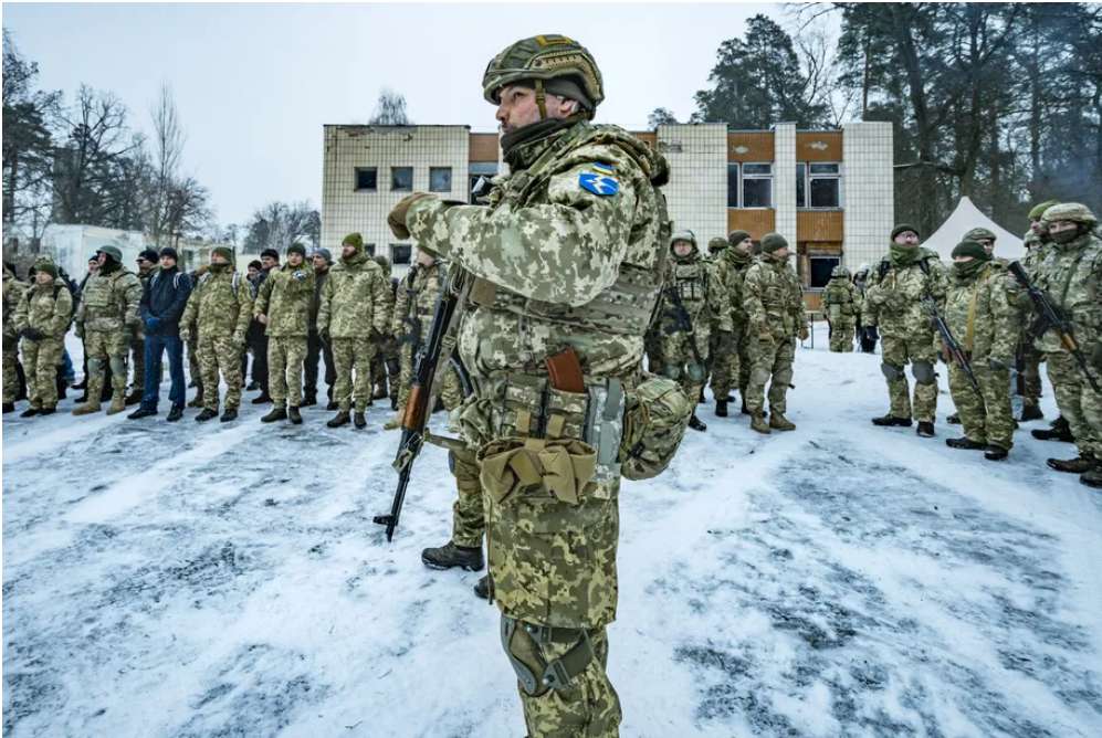
A military trainer with Ukraine's 112th Territorial Defense Brigade works with civilians during a military exercise outside Kyiv on February 5. The Ministry of Defense created defense brigades in Ukraine's main cities because of the risk of invasion by Russia, which is amassing troops at the border.