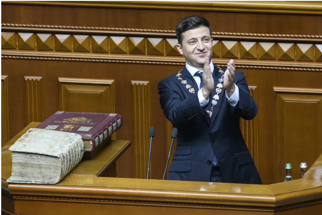
President-elect Volodymyr Zelensky claps during his inauguration in the Ukrainian parliament in Kyiv on May 20, 2019.

promised during his campaign that he would “reboot” peace talks to end the conflict in eastern Ukraine , including dealing with Putin directly to resolve the conflict. Russia, too, likely thought it could get something out of this: It saw Zelensky, a political novice, as someone who might be more open to Russia’s point of view.