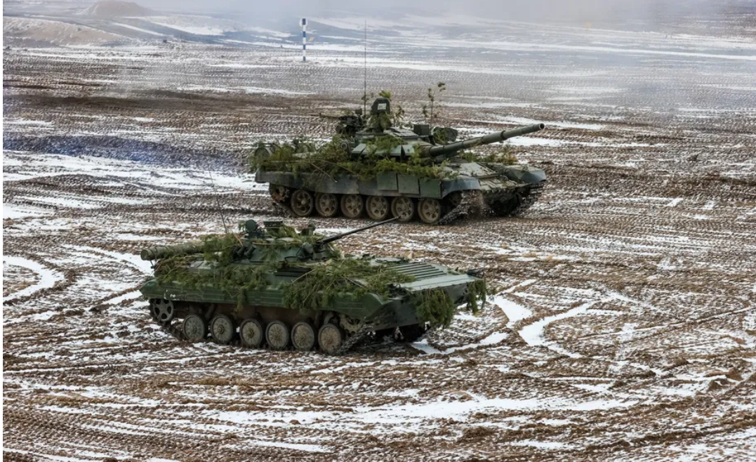
Russian and Belarusian forces conduct training exercises at a firing range in the Brest region of Belarus on February 3.

There are plenty of possible scenarios for a Russian invasion, including sending more troops into the breakaway regions in eastern Ukraine, seizing strategic regions and blockading Ukraine's access to waterways , and even a full-on war, with Moscow marching on Kyiv in an attempt to retake the entire country. Any of it could be devastating, though the more expansive the operation, the more catastrophic.