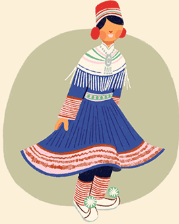
Sammi (Sweden, Finland, Norway, and Denmark)