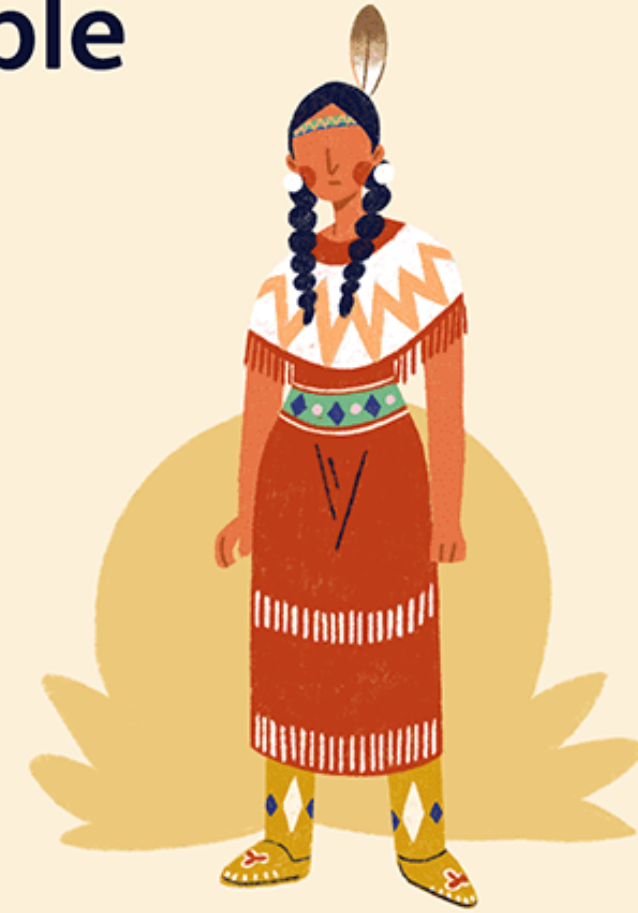
Native Americans (United States)