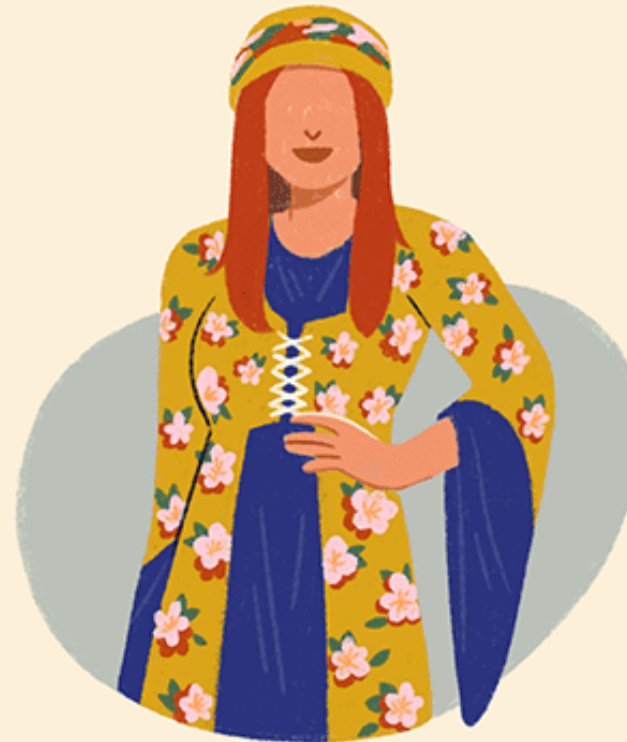
Kurds (Western Asia)