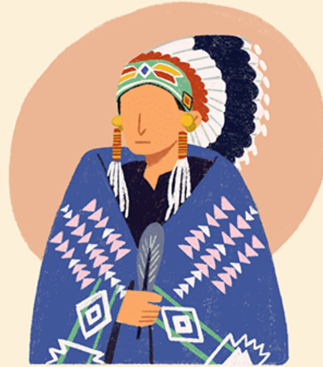
First Nations and Métis (Canada)