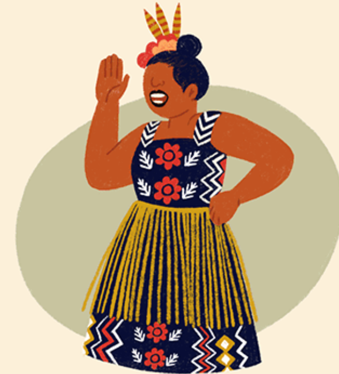
Maori (New Zealand)