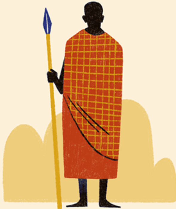
Maasai (East Africa)