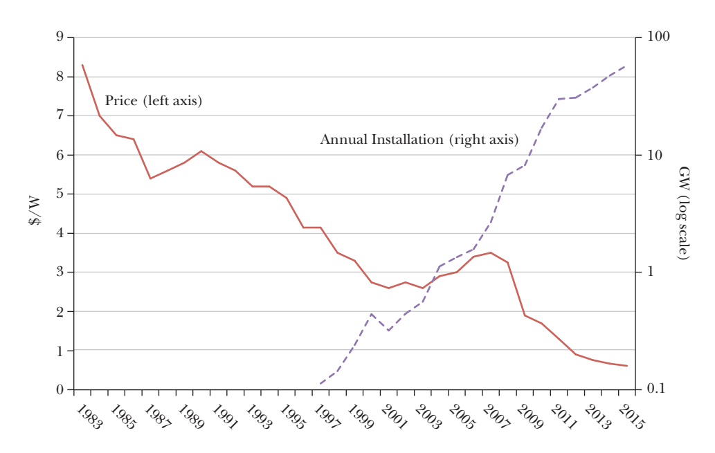
Solar Panel Price Indexes Excluding Subsidies and Cumulative Worldwide Installed Capacity, 1983–2015